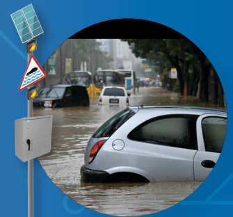
Flood Detection & Warning System