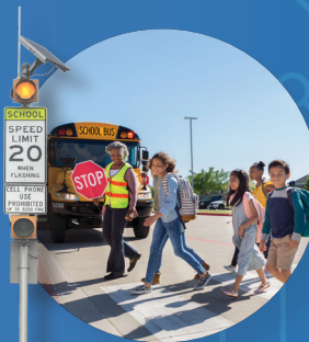
School Zone Flashing Beacons